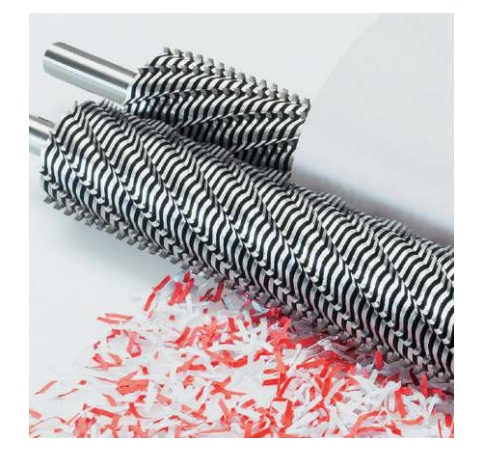
SOLID STEEL CUTTING SHAFTS

Robust and durable: high-quality paper clip proof cutting shafts with lifetime guarantee under conditions of fair wear and tear.